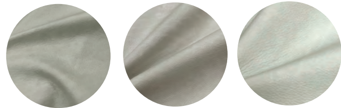
Elementary Riddle Zero