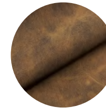
Walk The Walk